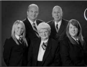
3 Generations of Morgan Family

Morse & Son Canada's First Funeral Home SERVICE • VALUE • FAMILY